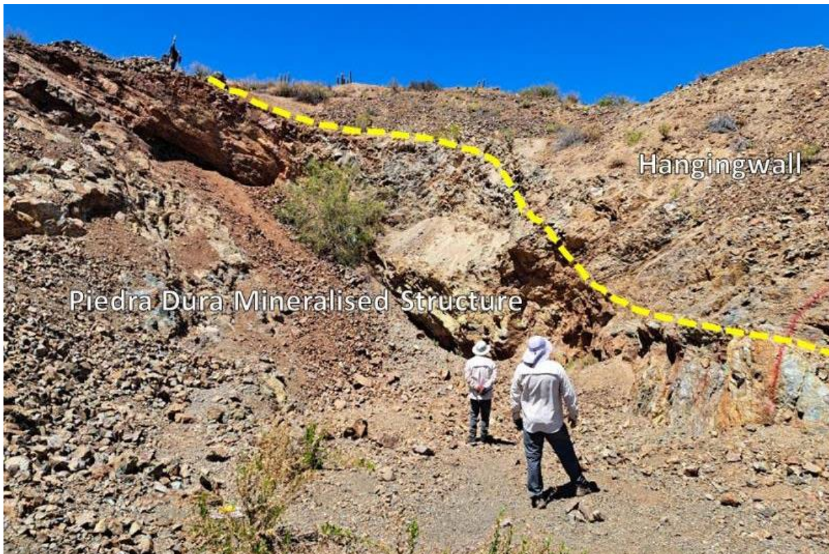
Figure 2: View looking south of the Piedra Dura Prospect mineralised zone.

The Piedra Dura Prospect is located 1.8km west of El Quillay within the Fortuna Project. The structurally controlled outcropping copper mineralisation has been delineated over 1.1km of strike and up to 100m width (Figure 2). Copper-oxide mineralisation at Piedra Dura has been historically exploited via both surface and underground mining. This represents the fourth key prospect that the Company has identified at the Project since its recent acquisition by Culpeo.