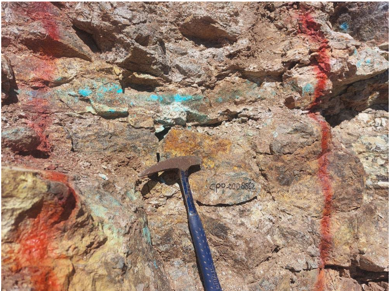
Figure 3: Significant copper mapped in outcrop, sample number CPO0008562, returned 4.16% Cu.

Of the initial 47 samples collected, 31 returned high-grade copper results >1% Cu (Appendix B) including a single sample of 4.16% Cu (CPO0008562) from within a brecciated volcanic unit, Figure 3.