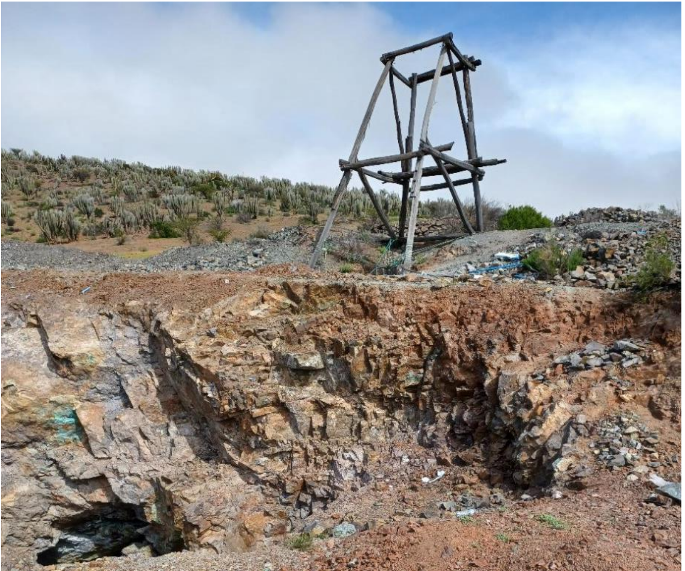
Figure 2: Numerous historic shafts and small-scale mining operations exist on the new tenement package.